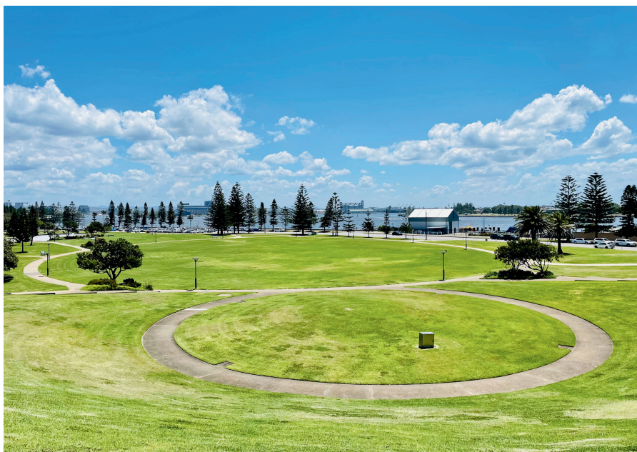
Foreshore Park Newcastle