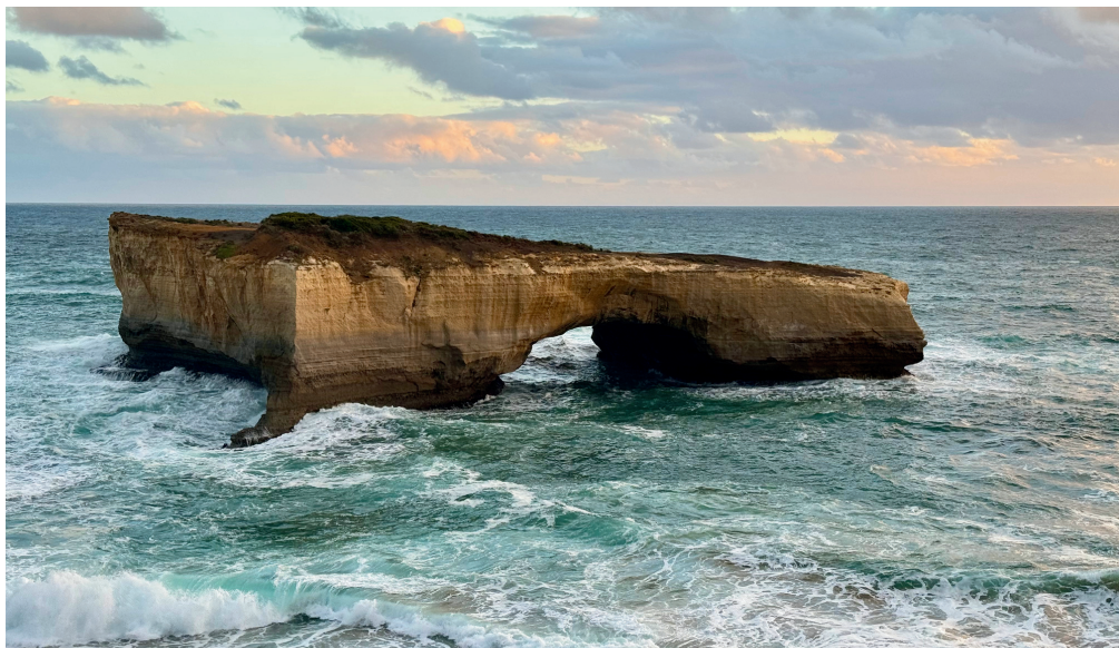
London Arc Port Campbell