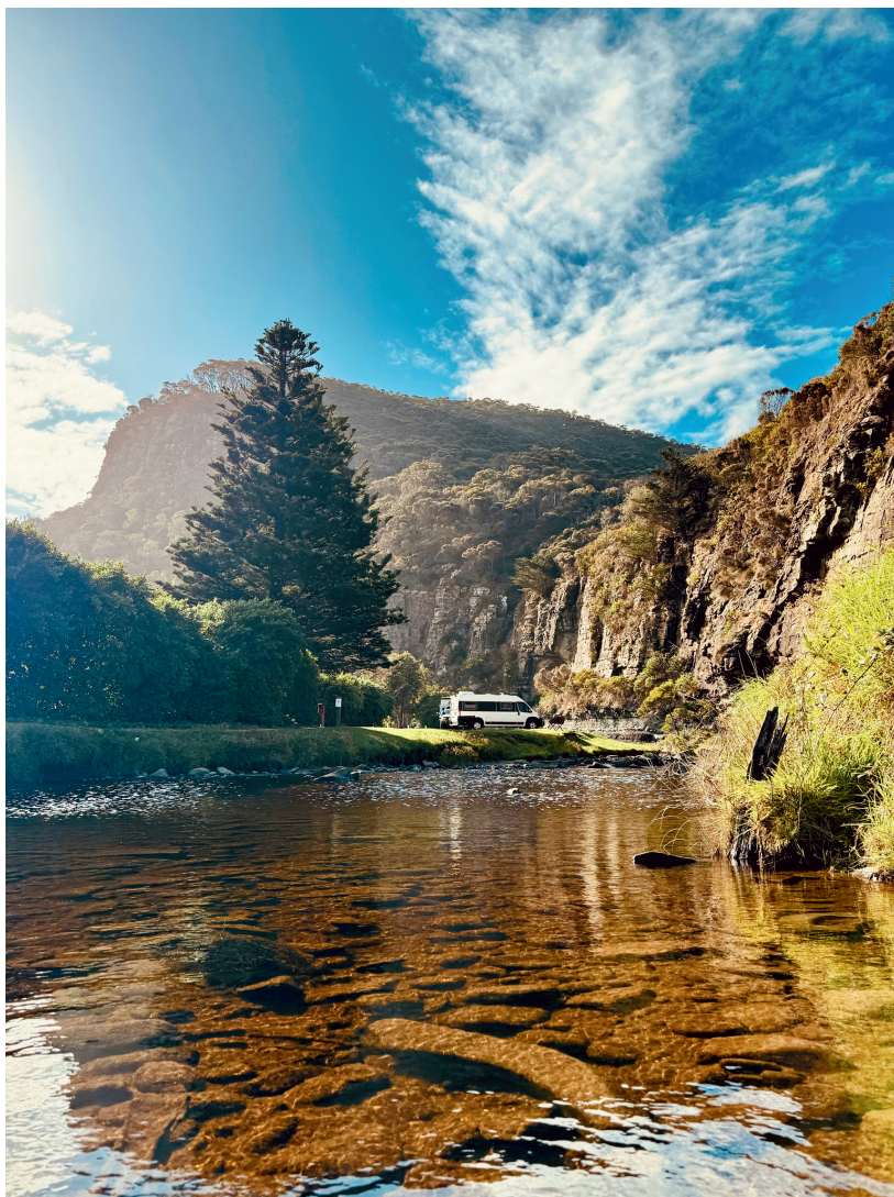
Cumberland National Park